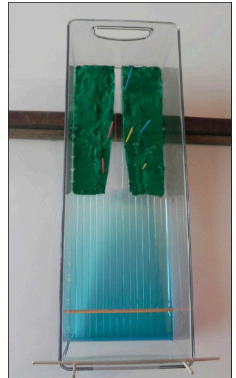
Figure B: View looking into the wave container. The variable in this example is a narrow inlet perpendicular to the coastline that is wider at the mouth. In this example, toothpicks mark points on the landscape.